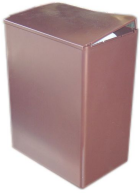
A Plastic Urn Add $30