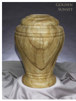
SUNSET Add $199