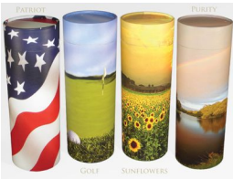
4 Options: Flag, Golf, Sunflower & Pond Add $99