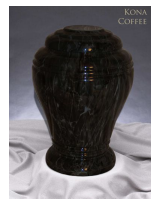
KONA COFFEE Add $199