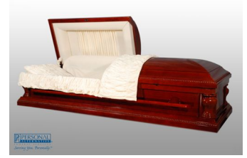
Liberty add $1099