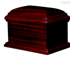
VINTAGE Add $329