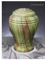
EVERGREEN Add $199